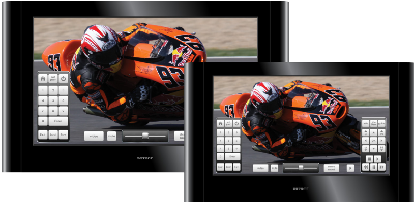
Figure 1: Touch TV displaying OSD overlaid on live video

Savant's Touch TV is an entertaining and dynamic graphical user interface (GUI), automation and control center, and full color HD LCD touch panel available in 18.5-, 24-, 40-, and 46-inch models (see TTV-1040 and TTV-1046 for information on the larger models). The Touch TV technology is the ideal multipurpose solution for viewing HD video content, while simultaneously functioning as a large HD display control interface. Simply tap the screens to access a multitude of control and automation services and subsystems including multizone audio and video, lighting, climate, security systems, network cameras and more.