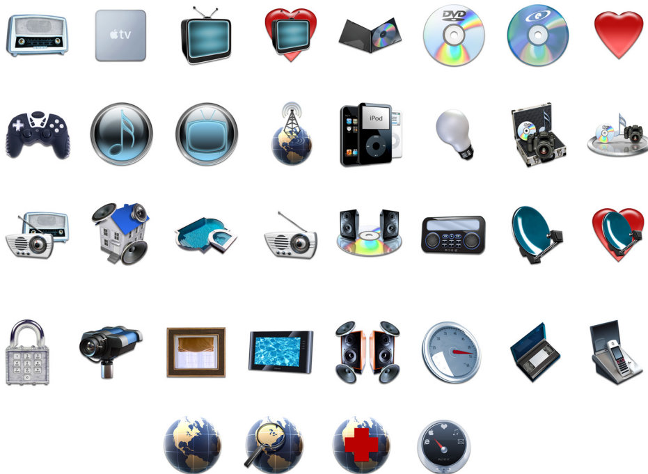
Figure 2: Library of photo-realistic service icons

Configure and readily customize the Touch TV interface using Savant's common design tool—RacePoint Blueprint™. With limitless flexibility and creativity, Savant empowers you to meet the stringent needs, personal preferences, and demands of your customers and installations.